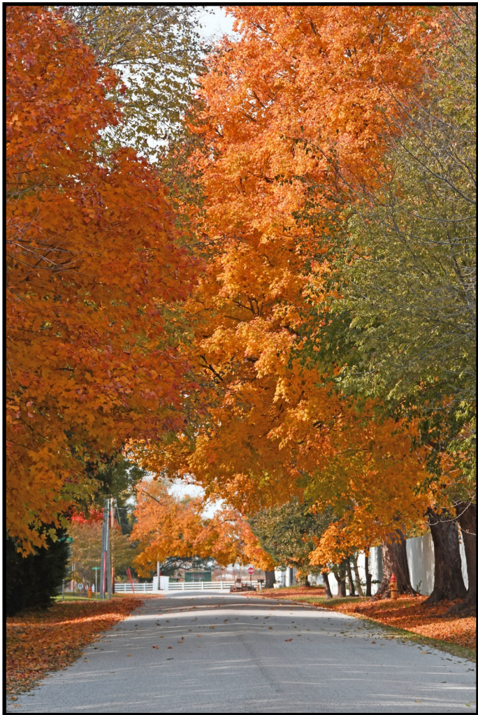
Fall Colors From Washington, Iowa